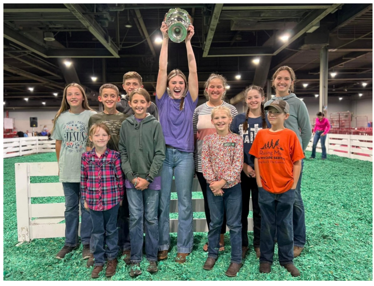
The Todd County 4-H Livestock Club won the Herdsman Award at the Kentucky State Fair, showcasing hard work, determination & sportsmanship.

100% gained patience, perseverance and sportsmanship in dealing with wins and losses and learning curves throughout the summer lamb project.