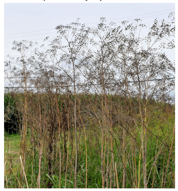
The photo below shows hemlock flowering in early June.

This is what hemlock looks like in mid-July, after it has completed its life cycle.