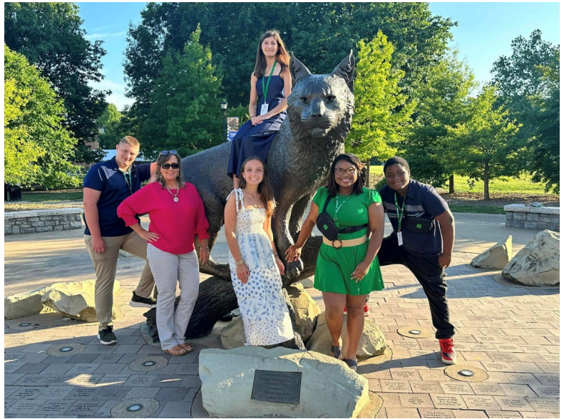
Good times at 4-H Teen Conference with this amazing group of 4-H teen leaders! Teen Conference is held on UK's campus in June!

The 4-H Teen Council is a special leadership council for teens that meets once a month during the school year at the Extension Office. Any 8th - 12th grader is invited to participate. The Area 4-H Teen Council is wrapping up the year with a rewards trip to Holiday World on May 27-28. Teens may also apply for the 4-H Teen Conference on UK's campus on June 10-13. Applications are due May 2nd. The 4-H Reality Store is May 9th, Teen Council members who want to work a booth need to sign up! Also camp teen counselor applications are due by May 23rd for qualified teens. Interviews will be held mid-late June for new counselors.